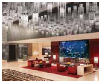
Oberoi Grand (top), Taj Santacruz (above)

This itinerary is subject to change at the discretion of The Metropolitan Museum of Art and Arrangements Abroad. For complete details, please carefully read the terms and conditions at www.arrangementsabroad.com/terms .