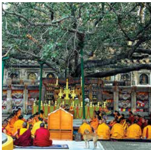
Bodhi tree, Bodhgaya