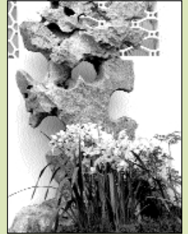
Can you find this detail in The Astor Court?

This garden was inspired by a courtyard in a scholar's garden in the city of Suzhou, near Shanghai, China. What do you think it was used for? How does it make you feel?