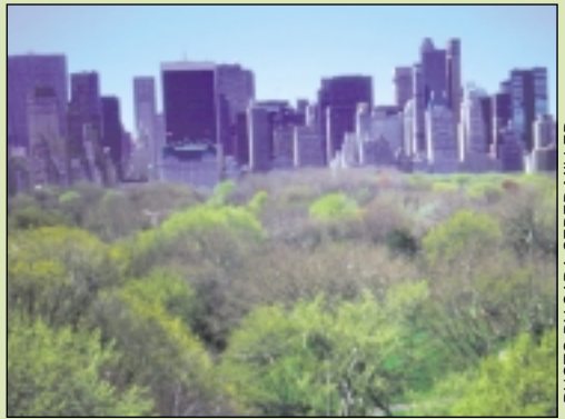
Where is this sky-high view?

The view from here is citywide. Buildings and park seen up high. Four floors up In the open air. Can the sculptures touch the sky?