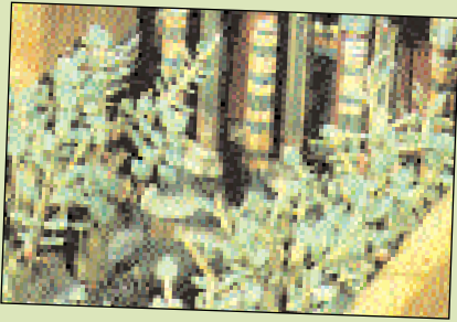
Where is this garden blooming?

2. Find this work in the Lila Acheson Wallace Galleries of Egyptian Art on the first floor. HINT: Take the corridor to the right of The Tomb of Perneb. Make a right and enter the first doorway you see.